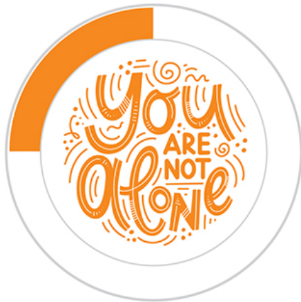
Score - Low