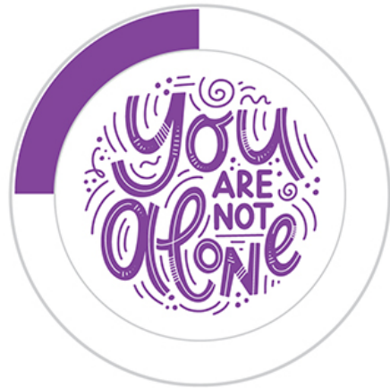
Score - Low

You may need to understand your own emotions and reflect on what you say or do when others share their emotions with you. Reading and understanding situations that require appropriate emotional responses is something you need to look at by learning ways to raise your sensitivity.